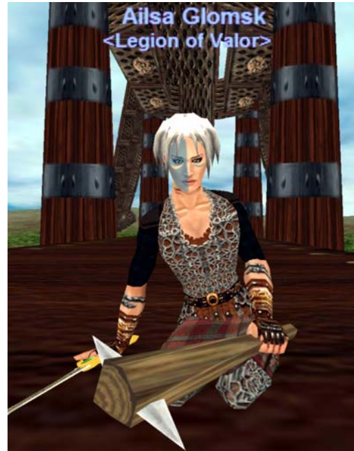
Figure 3. Character showing guildtag.

and its codes results in this command being used against a member. Sometimes the banishment is temporary, sometimes permanent. Given it marks a public and formal break of a member with their “family,” it is probably not surprising that its issuance is heavily controlled.