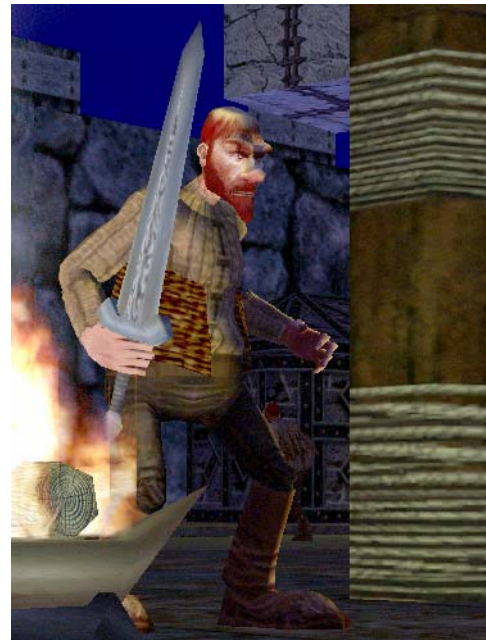
Figure 1: A giant with a sword.

Whenever a monster is killed, any member of the group that killed it can “loot” the corpse. Sometimes the looting results in a money reward, sometimes the corpse holds items that the looter can take possession of. The money from the monster is automatically divided equally between the characters in the group but items are not as easily shared. The group members have to agree on a looting scheme and then trust everyone to stick with it. These schemes range all the way from free looting to fairly complicated procedures.