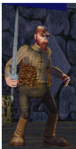
Figure 1: A giant with a (huge) sword.

Whenever a monster is killed, any member of the group that killed it can ‘loot’ the corpse. Sometimes the looting results in a money reward, sometimes the corpse holds items that the looter can take possession of. The money from the monster can be automatically divided between the characters in the group but items are not as easily shared. Group members have to agree on a looting scheme and then trust everyone to stick to it. These schemes range all the way from casual (free) looting to fairly complicated procedures and rules.